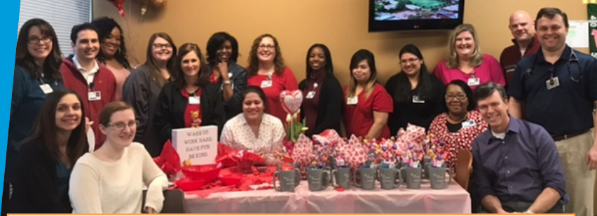
Featured Pic: The Medical Group is spending the month of February letting coworkers know they are appreciated a 'latte'. The team from Primary Care - Chenal participated in this event and enjoyed coffee, hot chocolate and all the fixings.